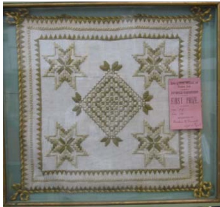
Embroidered Cushion Cover by Beatrice McConnell (Town of Gawler, Gawler Heritage Collection)