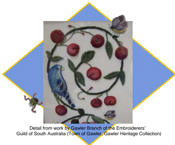
Detail from work by Gawler Branch of the Embroiderers' Guild of South Australia (Town of Gawler, Gawler Heritage Collection)