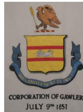
Gawler Crest (Town of Gawler, Gawler Heritage Collection)