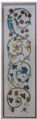
Elizabethan Embroidery (Town of Gawler, Gawler Heritage)