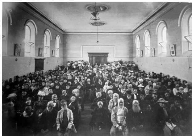
Gawler Institute, 1800s

Entertainment in the Hall above was varied. There were concerts, dances, band competitions, musicals, plays, demonstrations, a skating rink (1904), Gregory's Circus (1871) and a picture theatre (from 1911).