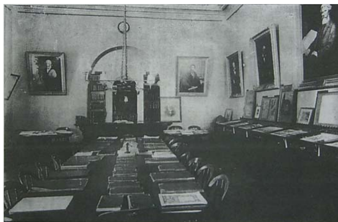
Gawler Institute Reading Room. c. 1908

In addition to the library and reading room, the Institute also provided technical education classes through a branch of the School of Design which was set up in about 1890. This provided secondary education for many people and gave them a trade. Classes in typing and shorthand were also offered and many young men and women regularly attended the various classes.