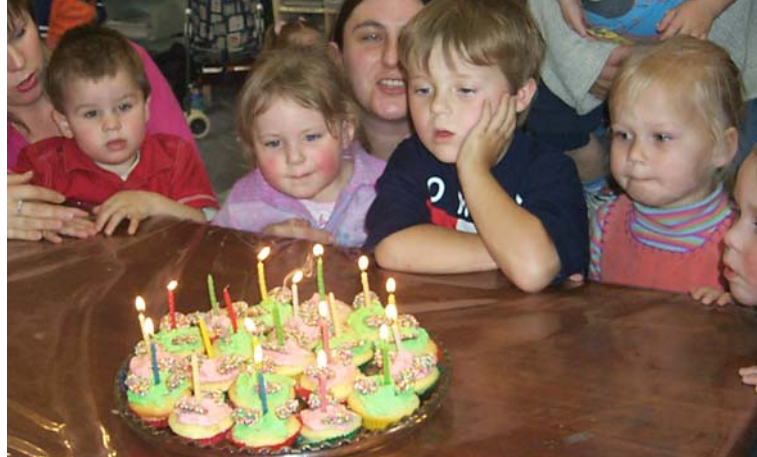
Celebrating Gawler Public Library's 20th Birthday

In October 2005, a Library Depot was established at the Sport and Community Centre, allowing library patrons the ability to return and collect items during the extended hours that the Sport Centre is open.