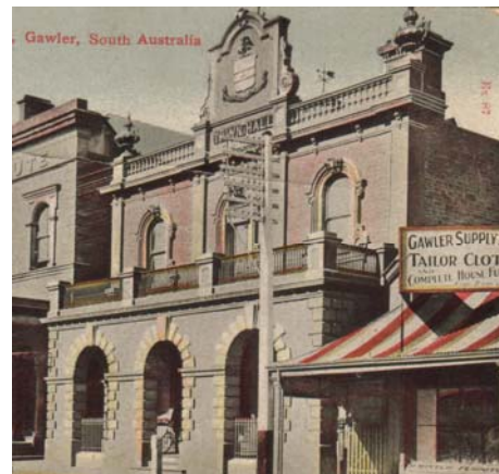
Gawler Town Hall, date unknown (Town of Gawler, Gawler Heritage Collection)

Council borrow £1500 to build a Council Chamber, dwelling house and shed on a site on Lyndoch Road. This was carried unanimously but there was doubt about the suggested amount. Once again, disagreement arose over the site and a meeting of ratepayers called for another poll to be held. The majority voted for use of the Northern Market Allotment but when a legal opinion was sought it was discovered that the Trust Deed conveyed to the Council in 1864 prevented anything other than a market being built on the land as that was its allocated purpose in the original town plan of 1839.