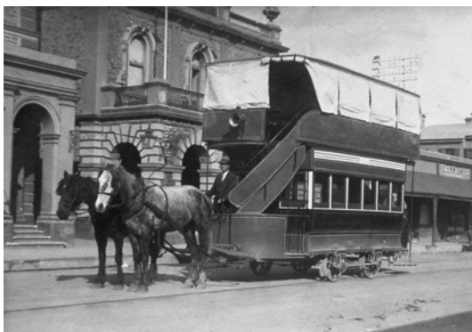
Horse-drawn tram at Town Hall, ca. 1915.