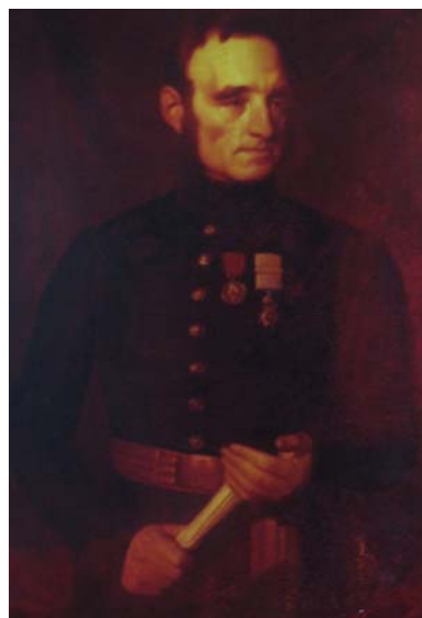
Colonel George Gawler, ca. 1843.