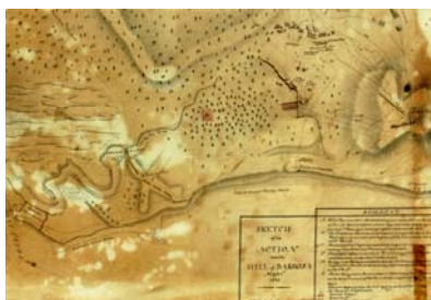
A tinted pen and ink sketch titled 'Sketch of the action near the hill of Barrosa, May 1811'. Thought to be the work of George Gawler, the original was presented by Canon Coombs to Gawler Institute on 4 January 1887. (Town of Gawler, Gawler Heritage Collection)

Gawler saw no alternative but to treat the situation as an emergency and on his own authority he increased the number of public officials, raised the salaries of juniors, recommended increases for the rest; organised a police force according to a plan he had submitted before leaving England and then enlarged it; re-organised the Survey Department and hired surveyors. Gawler was an intelligent man who attempted to solve the problems of the colony by expanding government expenditure. He did what was necessary without appraising the costs, expecting his decisions to be accepted by his superiors. His expenditure steadily rose and by the end of his thirty-one months in office, he had drawn bills on the South Australian Colonisation Commission for £200,500. The Commission was dissolved in 1840 and a new board of three