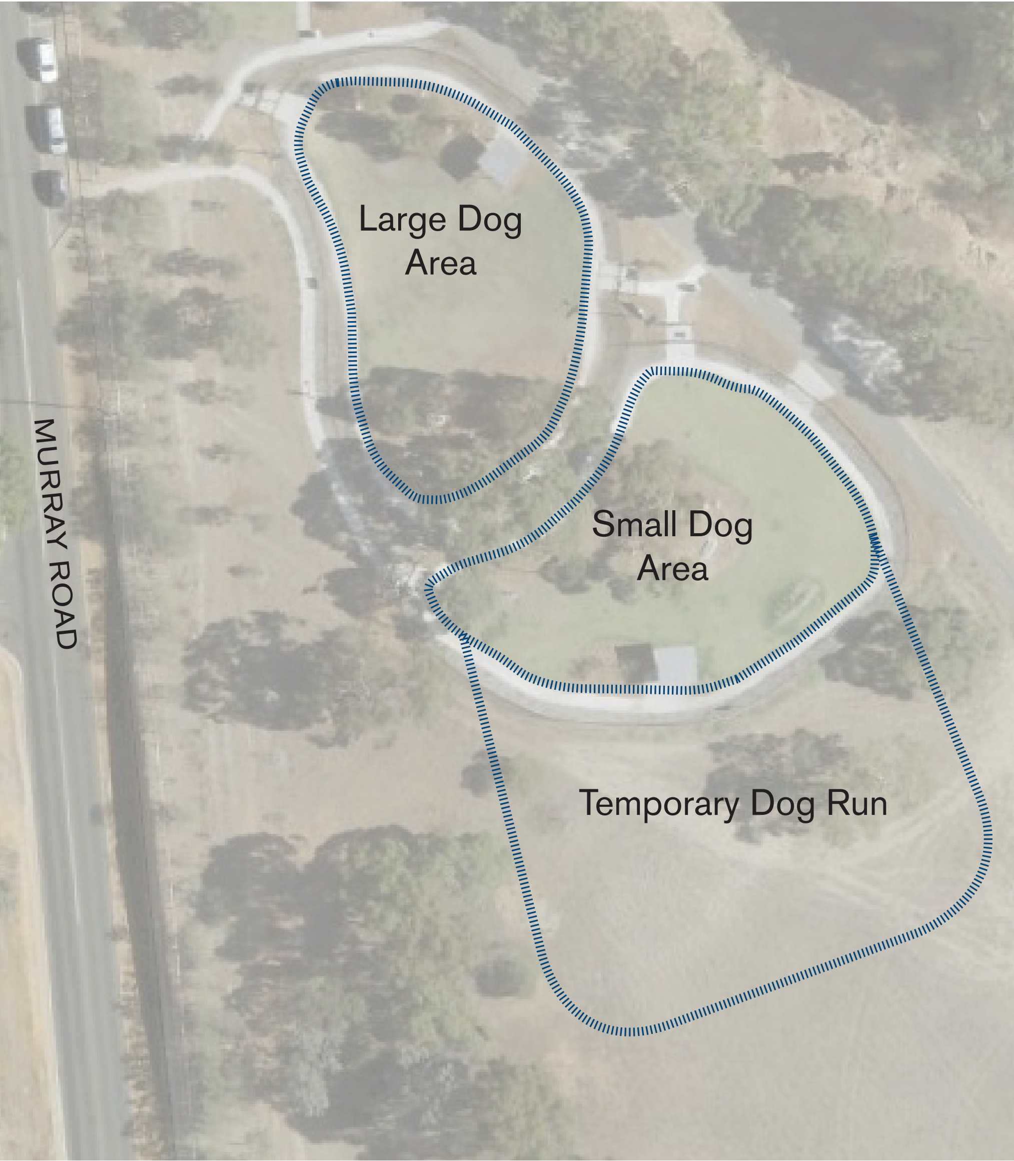
Existing Site Arrangement